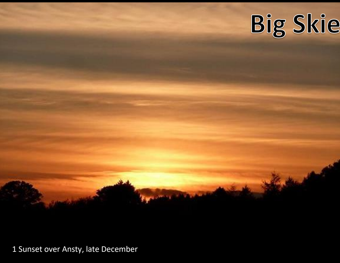
1 Sunset over Ansty, late December