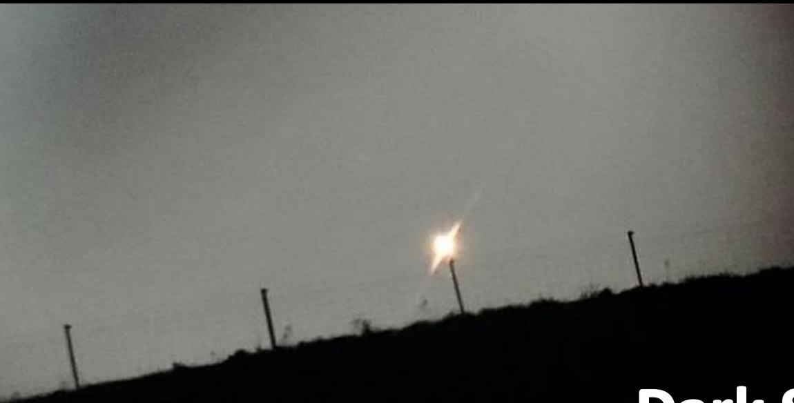
2 Venus sitting on a fence post