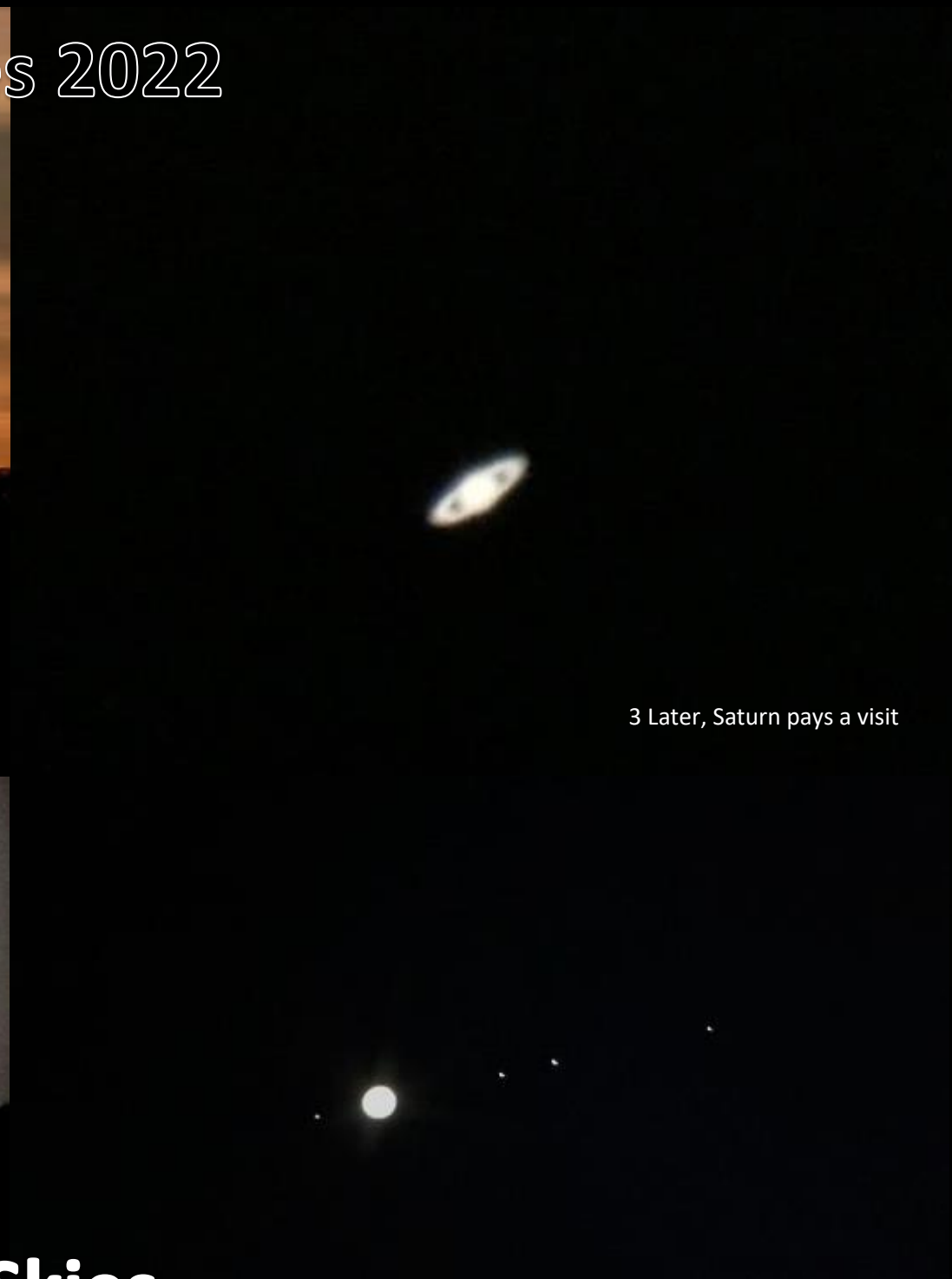
3 Later, Saturn pays a visit