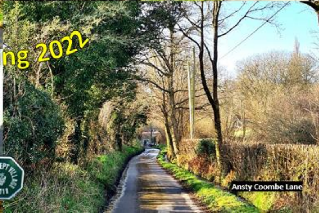
Ansty Coombe Lane