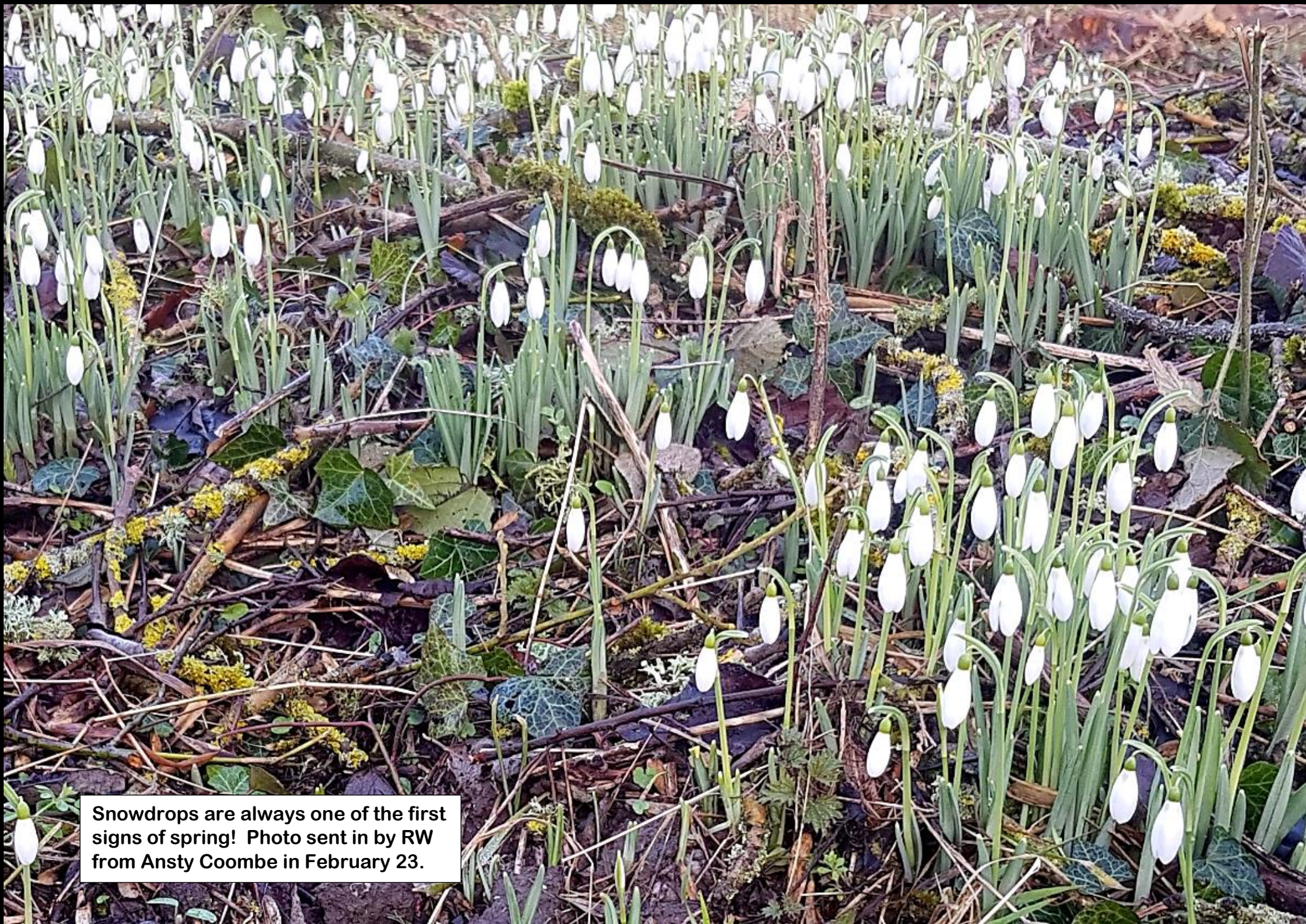
Snowdrops are always one of the first signs of spring! Photo sent in by RW from Ansty Coombe in February 23.