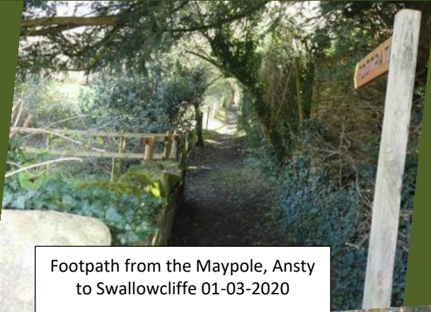
Footpath from the Maypole, Ansty to Swallowcliffe 01-03-2020