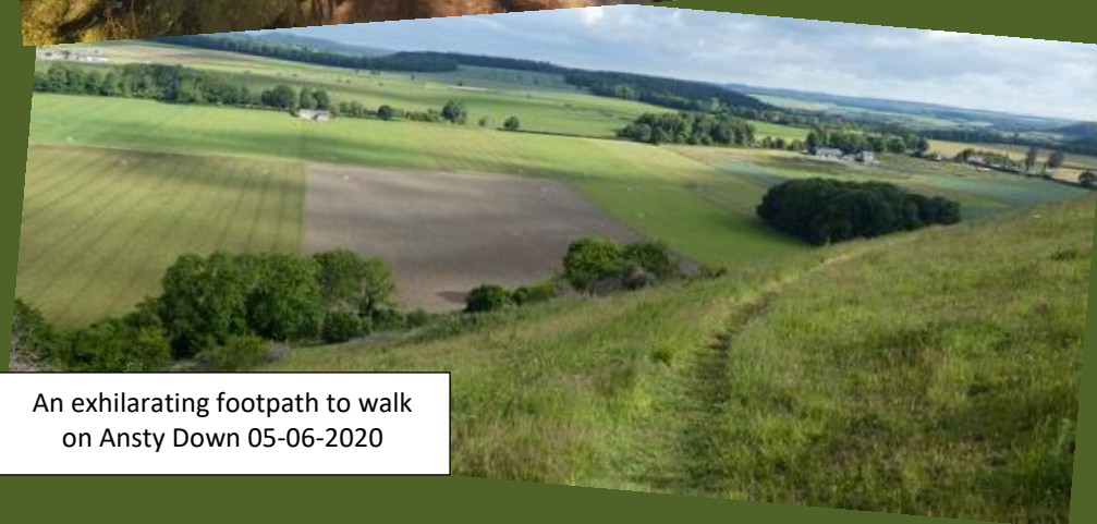
An exhilarating footpath to walk on Ansty Down 05-06-2020