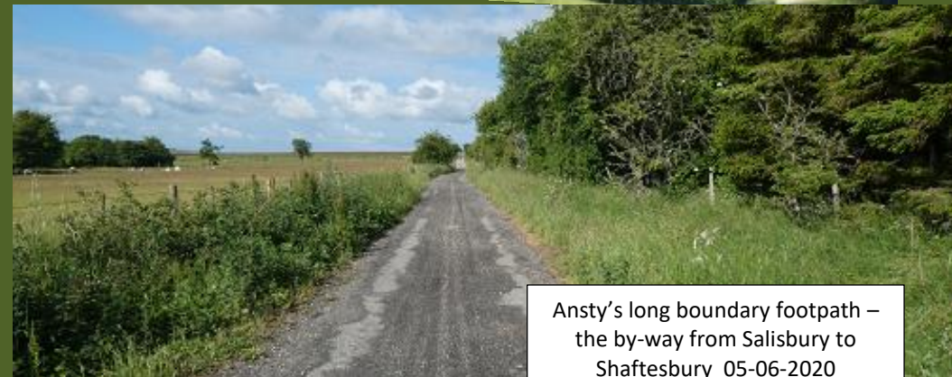
Ansty's long boundary footpath – the by-way from Salisbury to Shaftesbury 05-06-2020