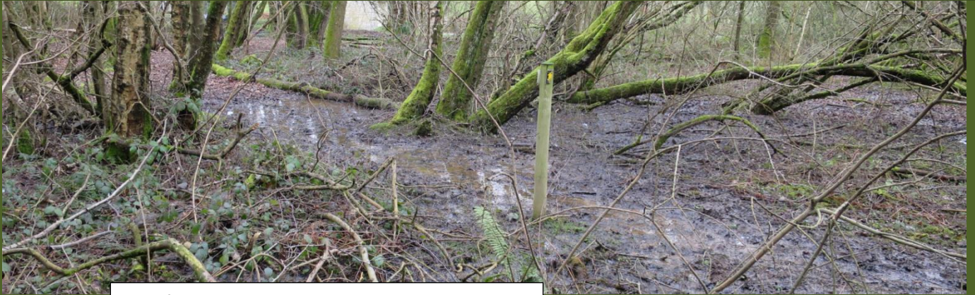
All footpaths in Ansty were absolutely soggy wet after a record breaking wet autumn and winter 01-03-2020