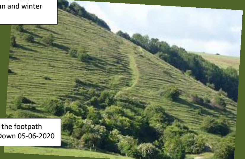
A fine view of the footpath ascending Ansty Down 05-06-2020