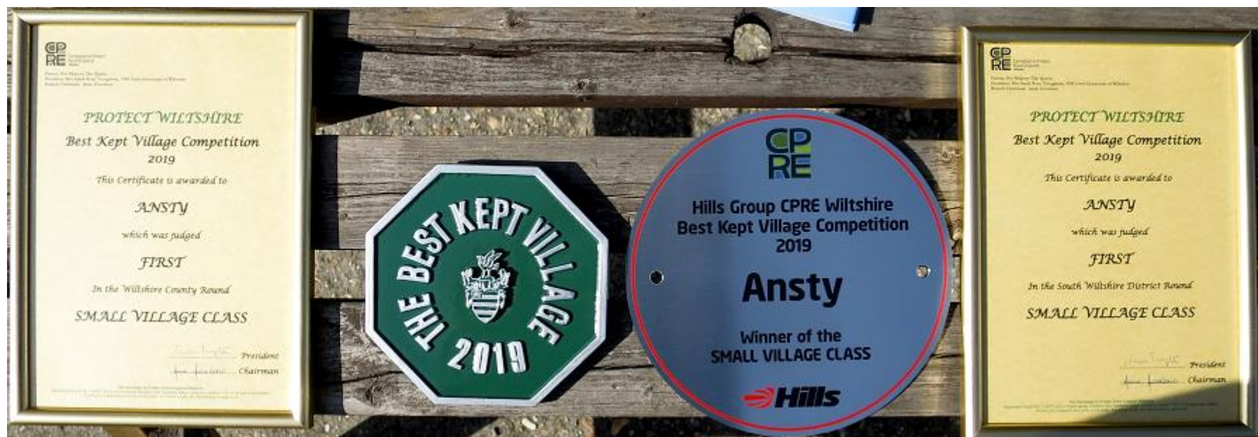
Ansty's winning certificates and plaques

ANSTY RECEIVED SEVERAL AWARDS FOR WINNING THE BEST KEPT SMALL VILLAGE IN WILTSHIRE CATEGORY IN 2019