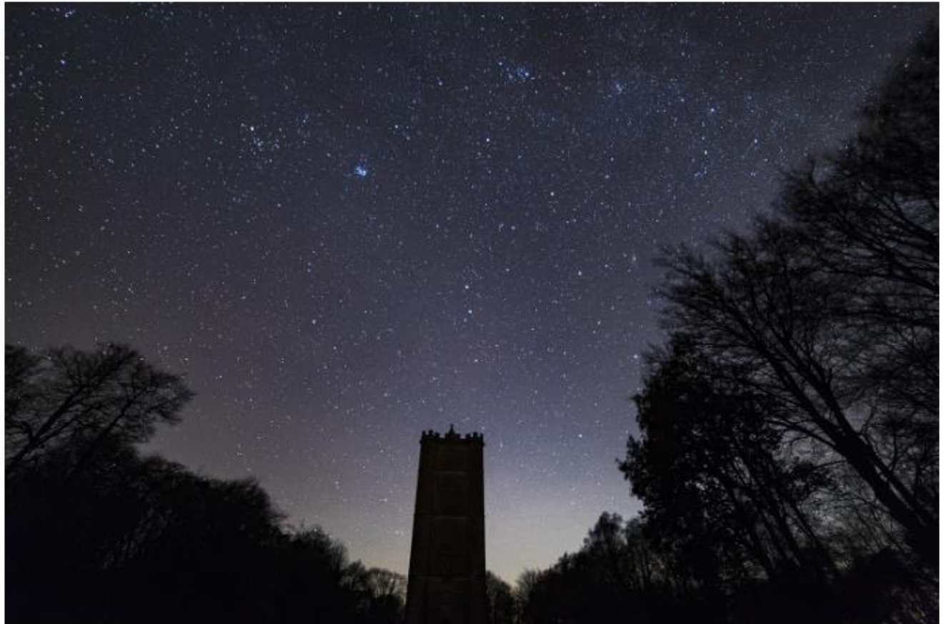
King Alfreds Tower, Stourhead, Wiltshire.