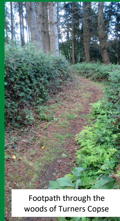
Footpath through the woods of Turners Copse