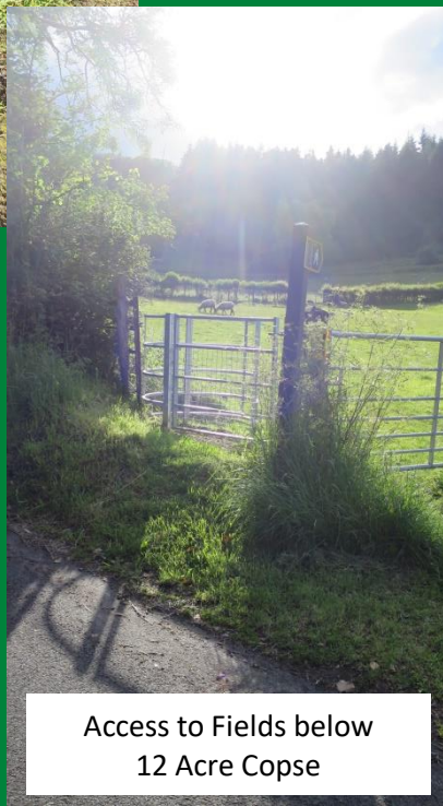
Access to Fields below 12 Acre Copse