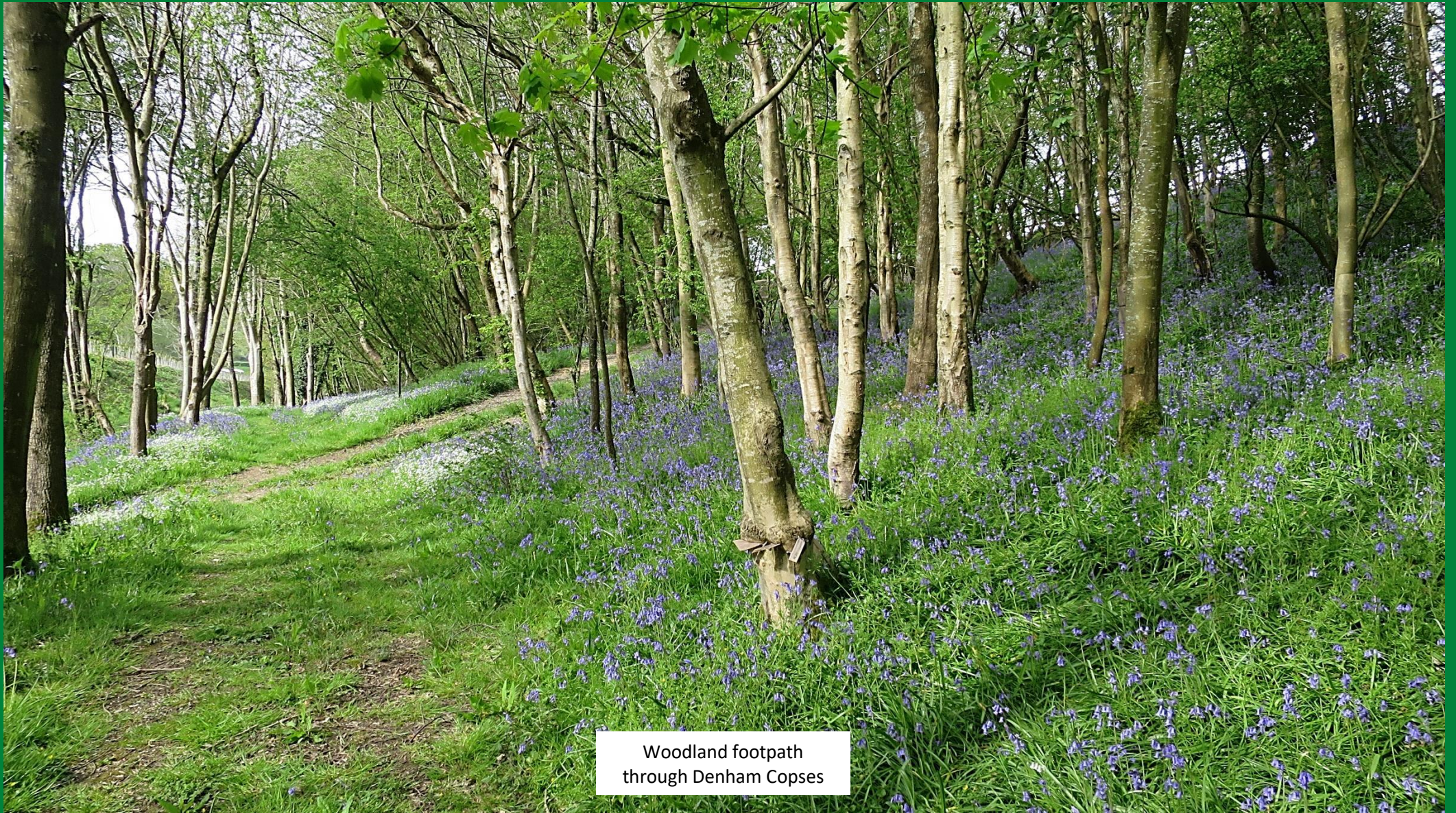
Woodland footpath through Denham Copses