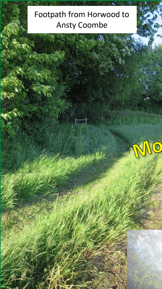
Footpath from Horwood to Ansty Coombe