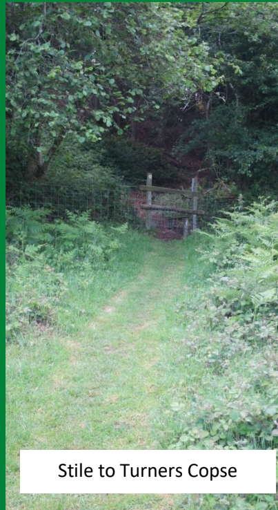
Stile to Turners Copse