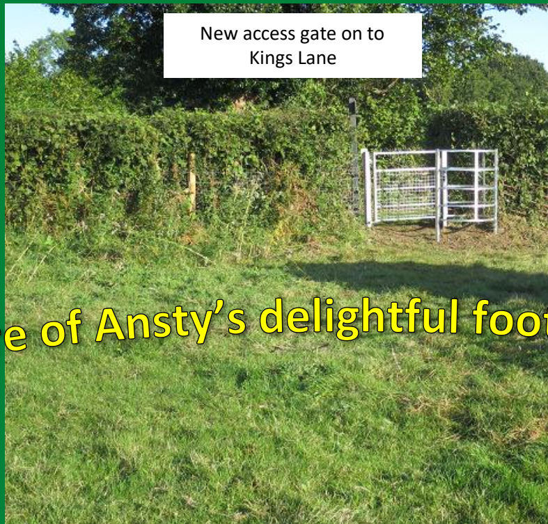
New access gate on to Kings Lane