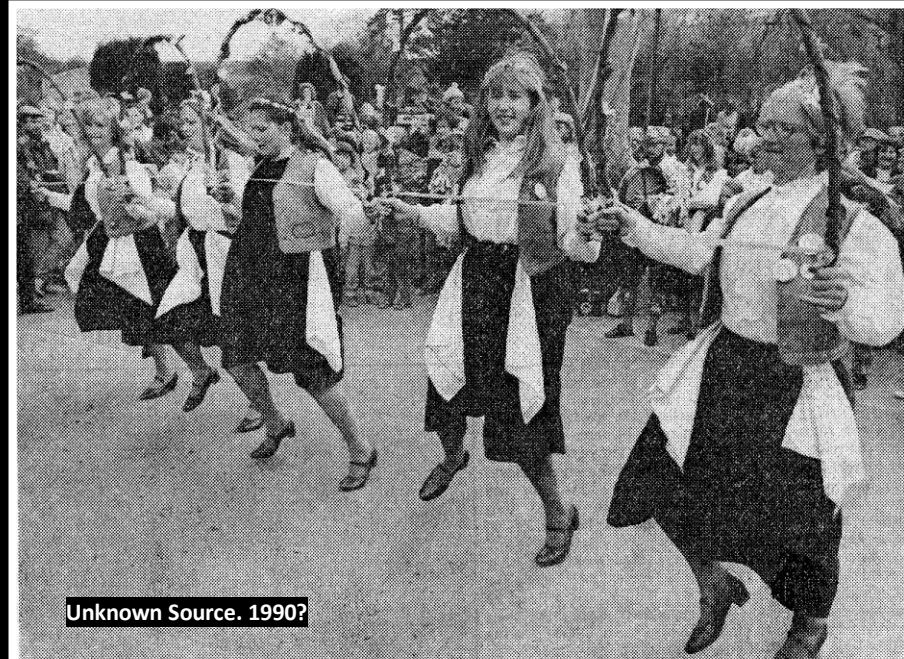
Unknown Source. 1990?

IN action are the ladies of the Dorset Trump Dancers who were making their third consecutive appearance at the bank holiday celebrations.