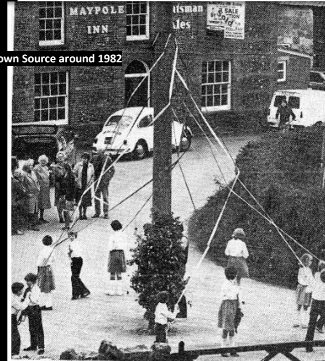
Unknown Source around 1982