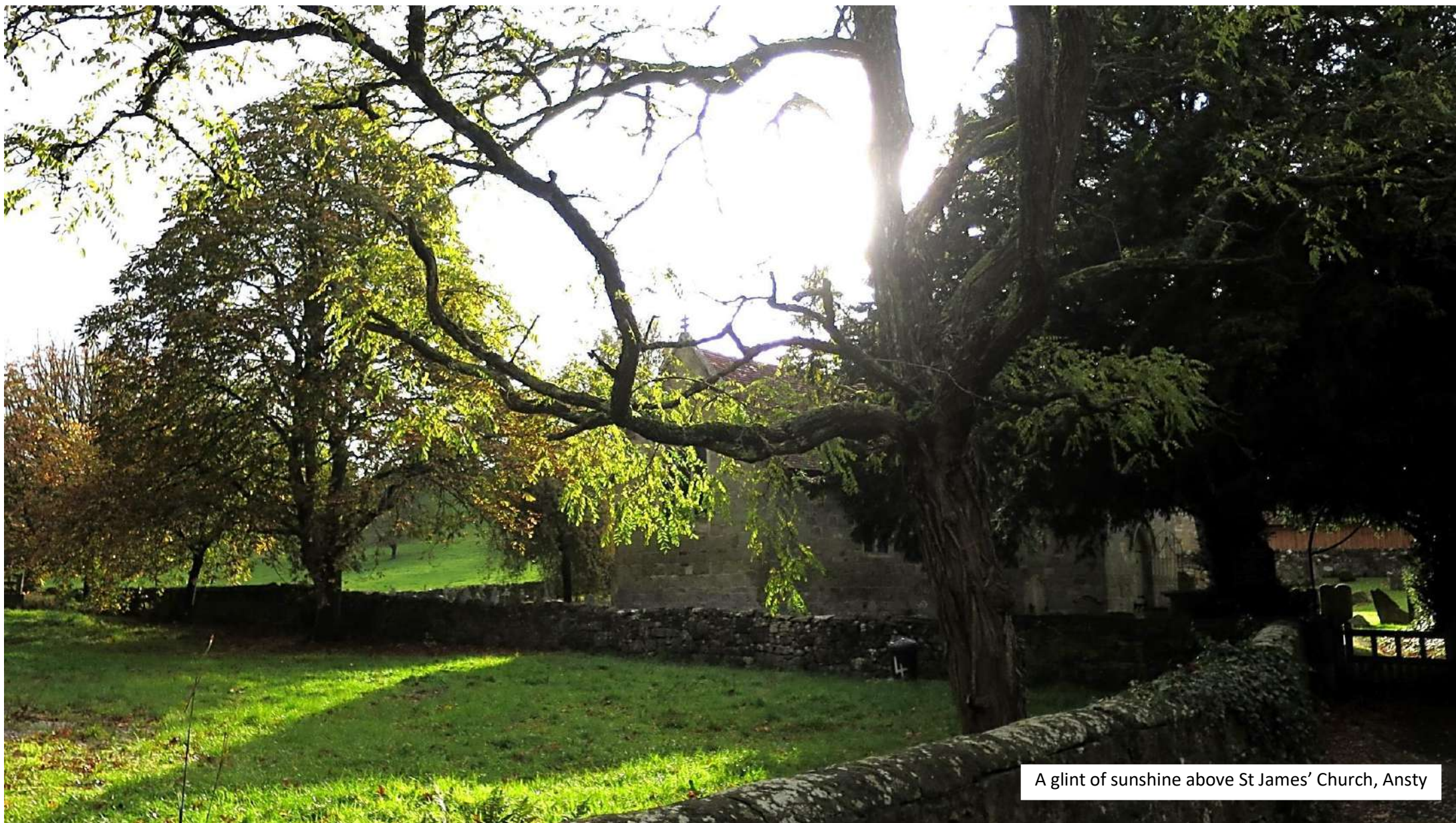
A glint of sunshine above St James' Church, Ansty