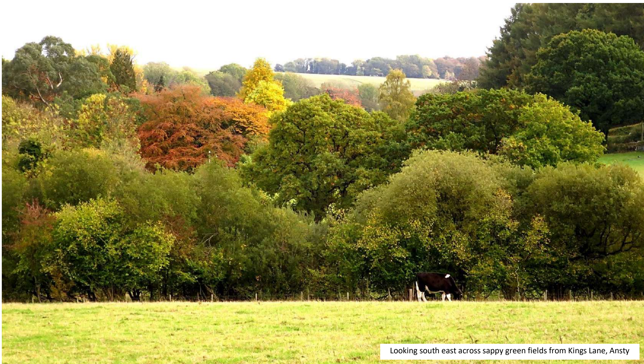
Looking south east across sappy green fields from Kings Lane, Ansty