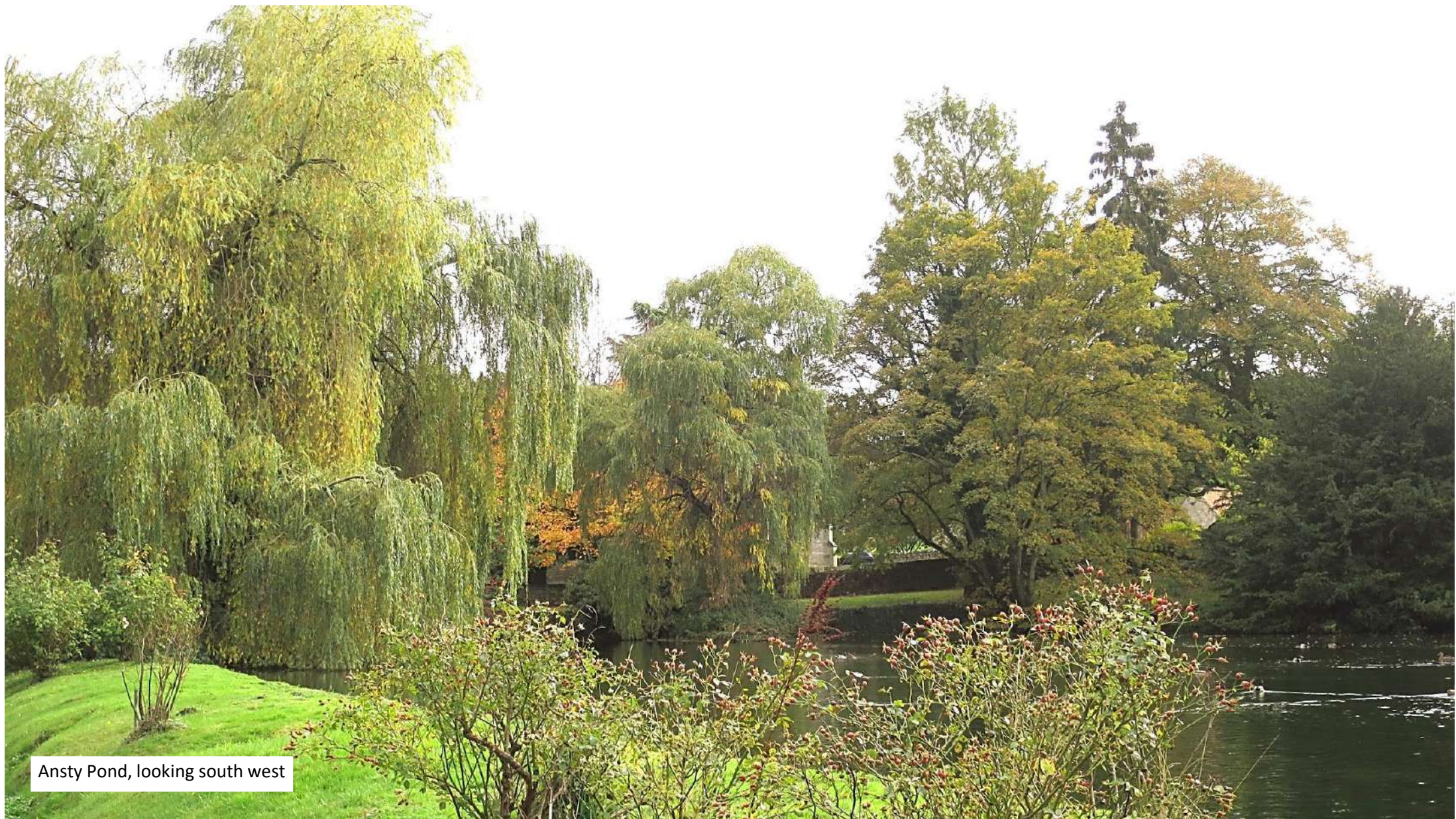
Ansty Pond, looking south west