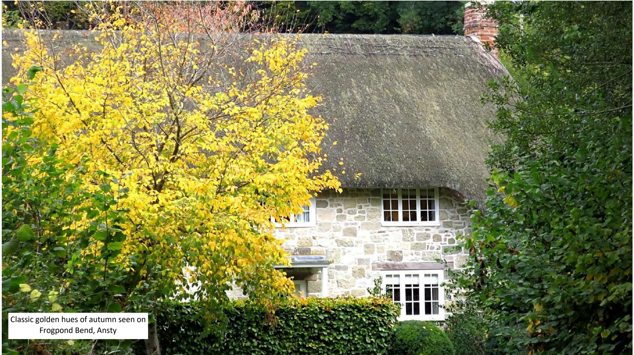
Classic golden hues of autumn seen on Frogpond Bend, Ansty