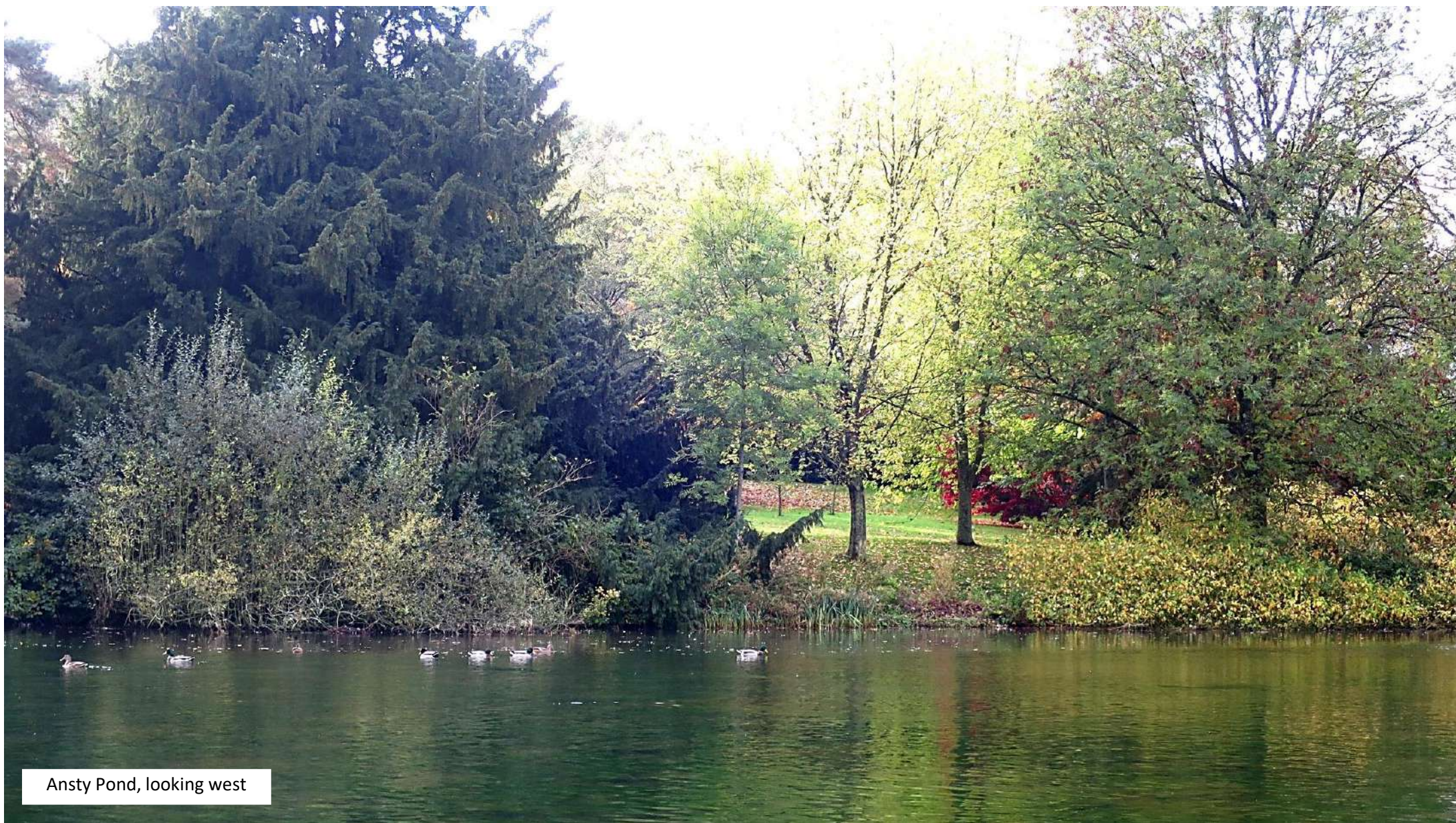
Ansty Pond, looking west