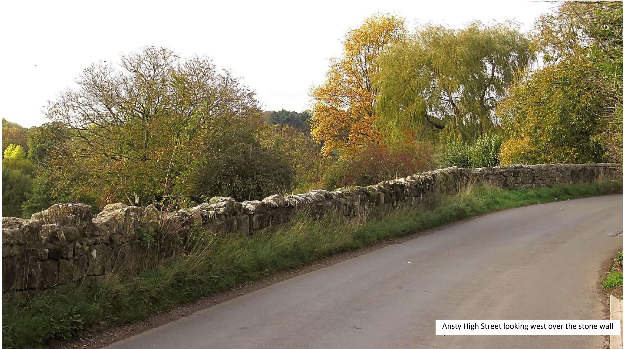
Ansty High Street looking west over the stone wall