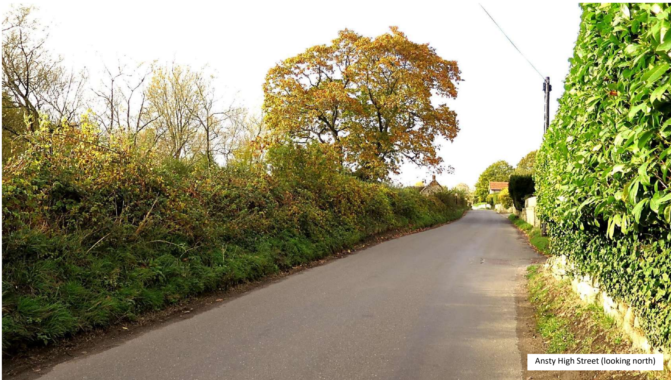
Ansty High Street (looking north)