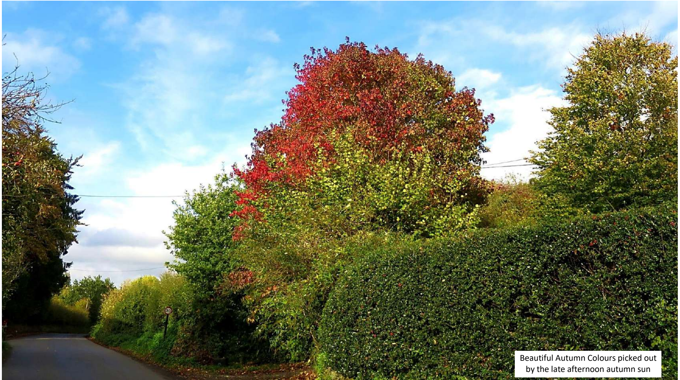
Beautiful Autumn Colours picked out by the late afternoon autumn sun