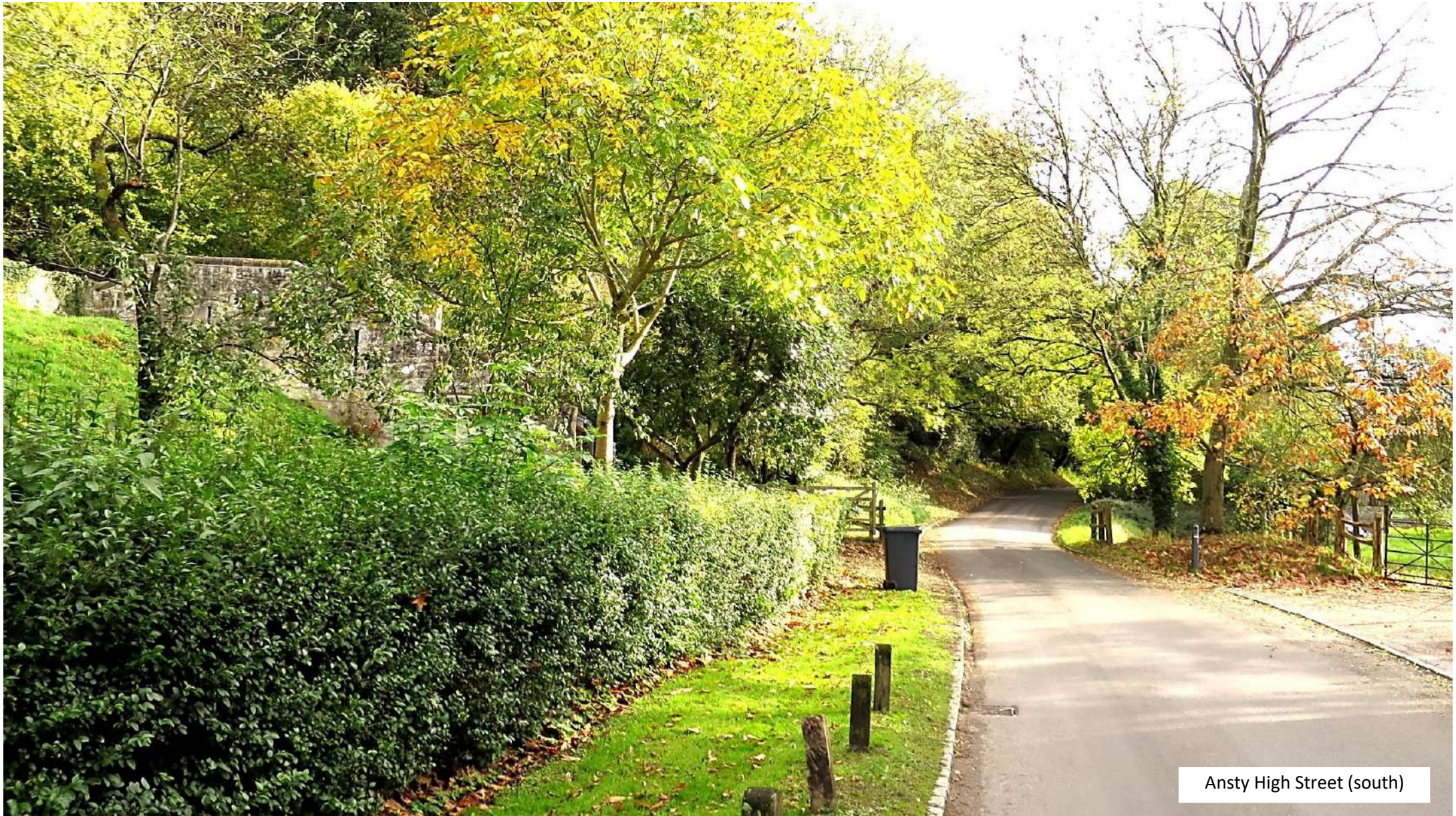
Ansty High Street (south)