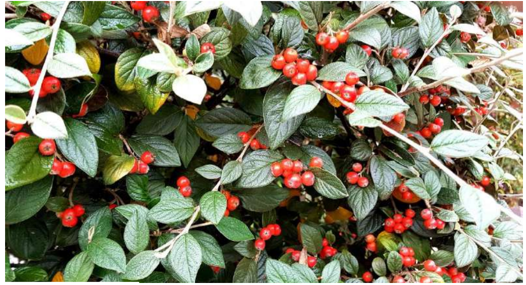
More classic signs of autumn in and around Ansty