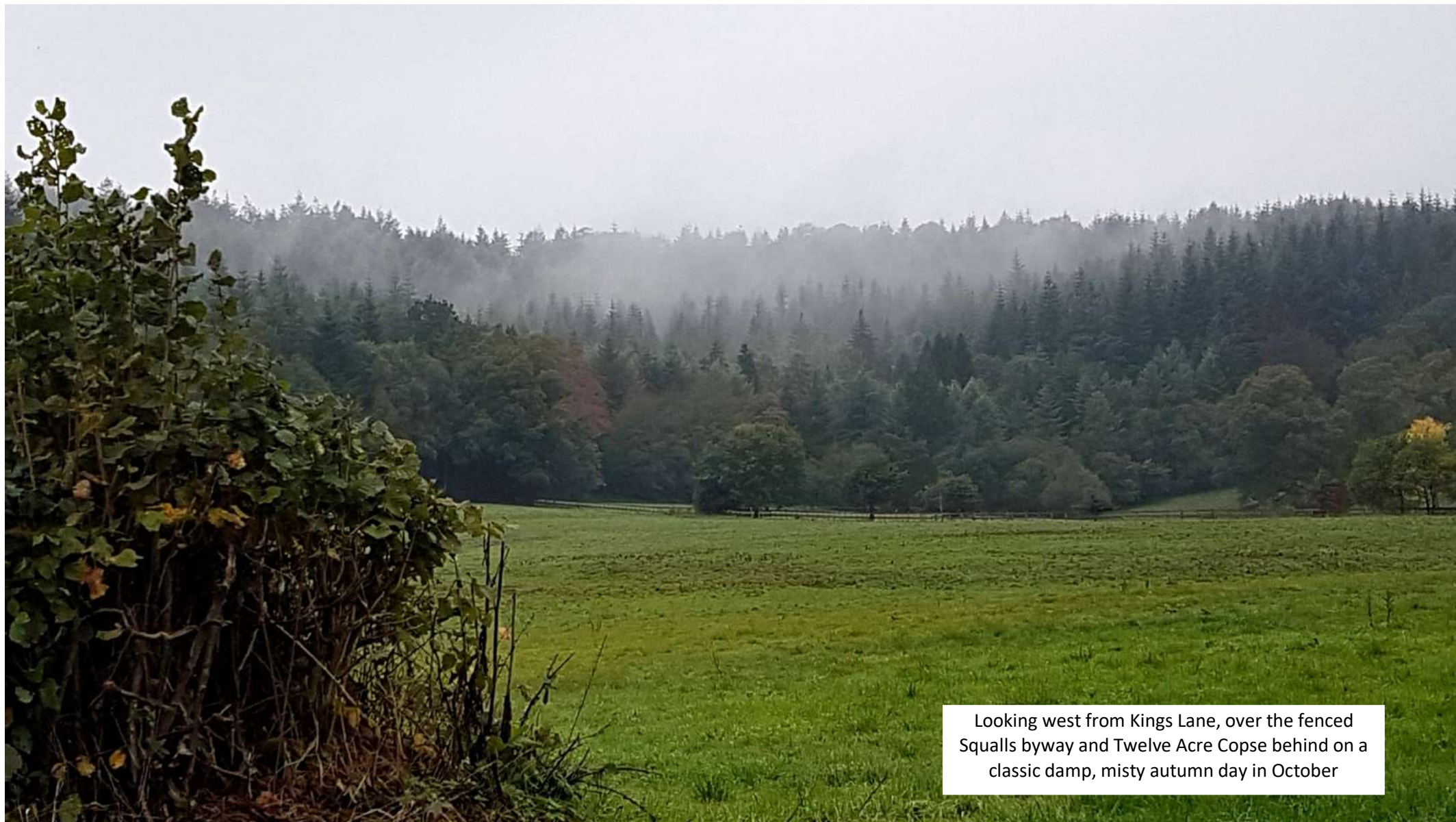
Looking west from Kings Lane, over the fenced Squalls byway and Twelve Acre Copse behind on a classic damp, misty autumn day in October