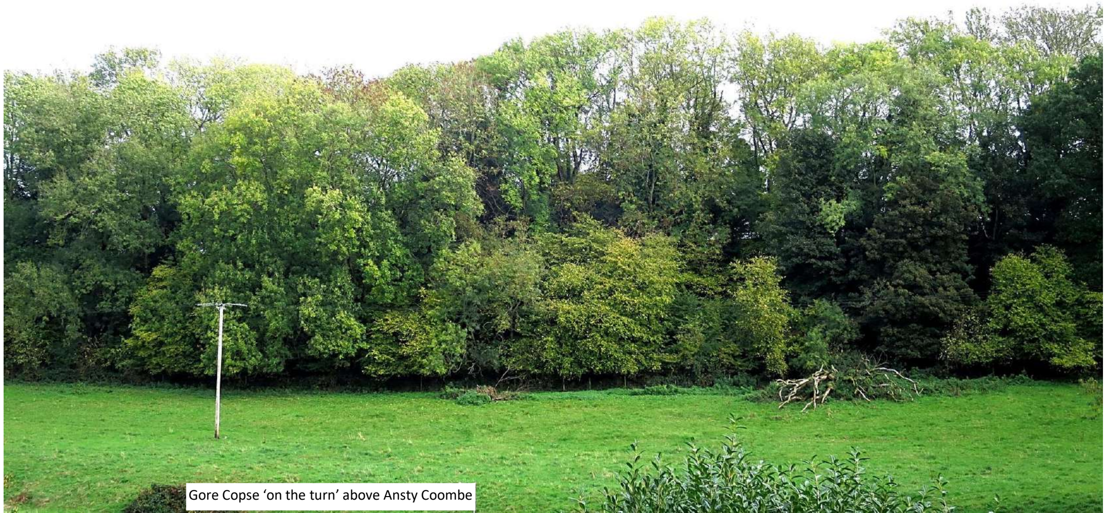
Gore Copse 'on the turn' above Ansty Coombe