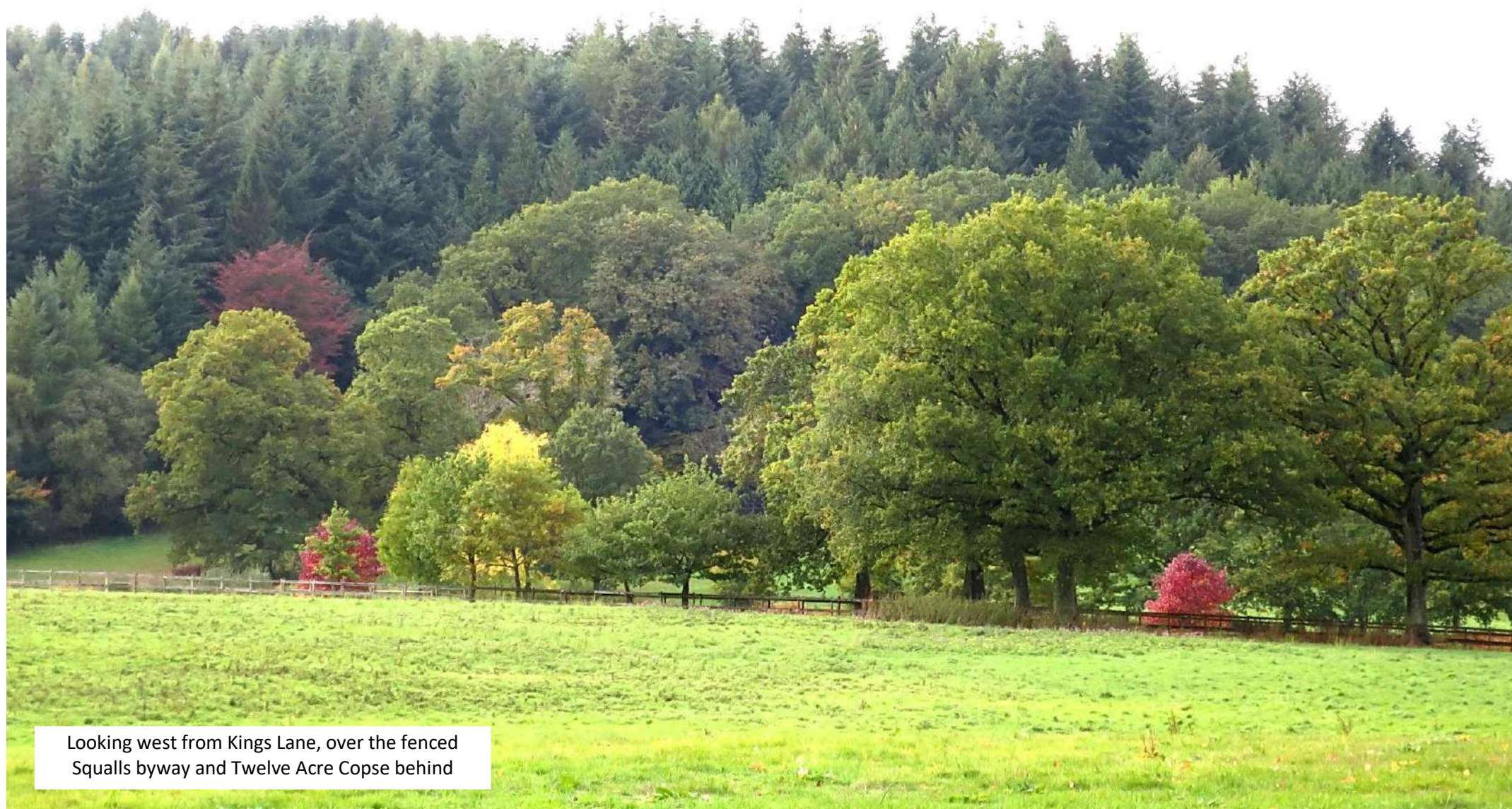
Looking west from Kings Lane, over the fenced Squalls byway and Twelve Acre Copse behind