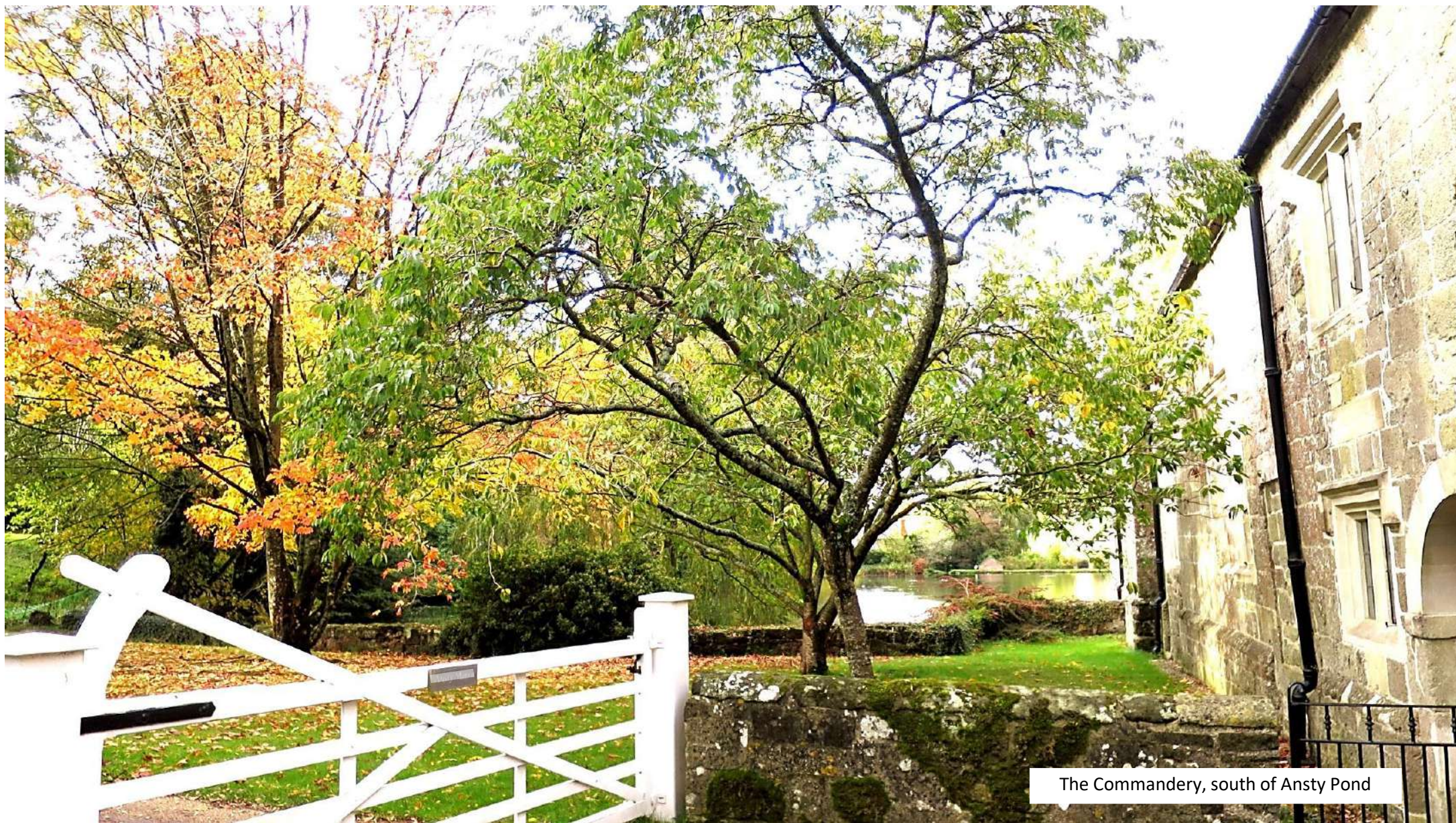
The Commandery, south of Ansty Pond