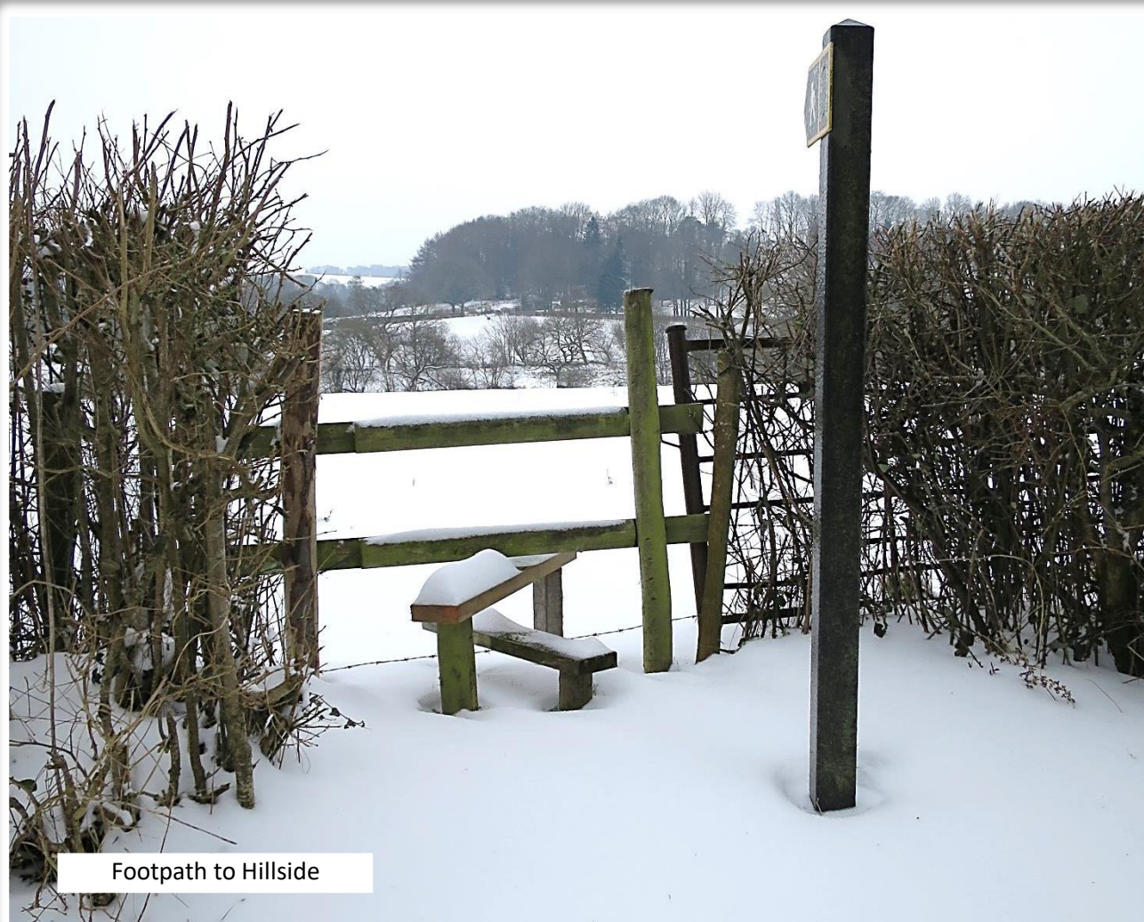
Footpath to Hillside