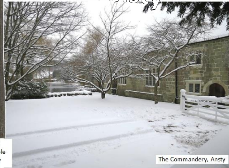
The Maypole Ansty