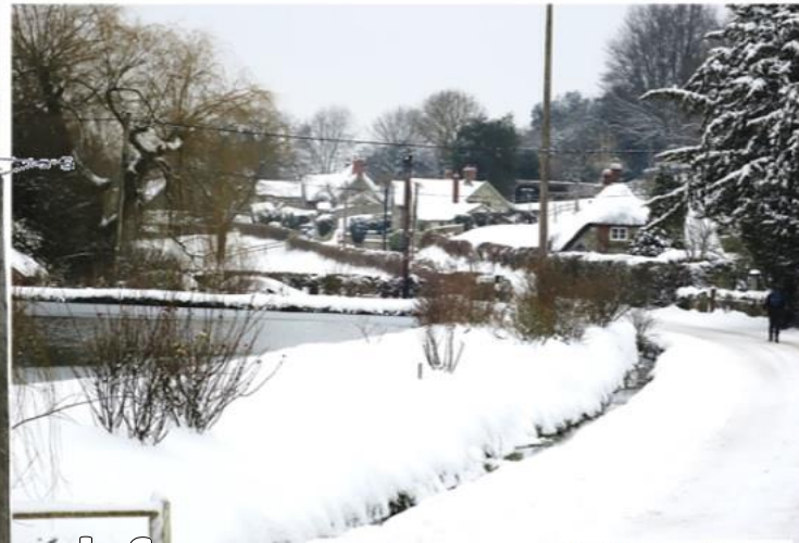
The High Street, Ansty