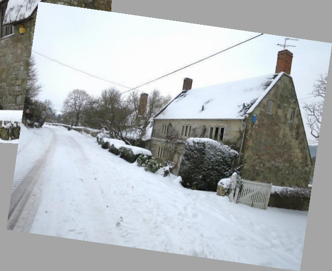
Snowy cottages, Ansty High Street