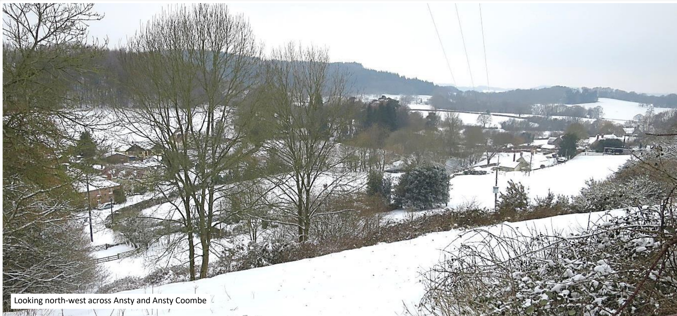
Looking north-west across Ansty and Ansty Coombe