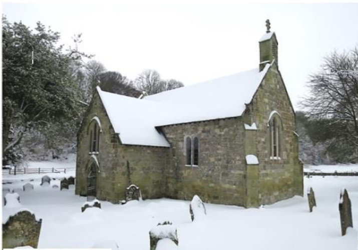
St James' Church, Ansty