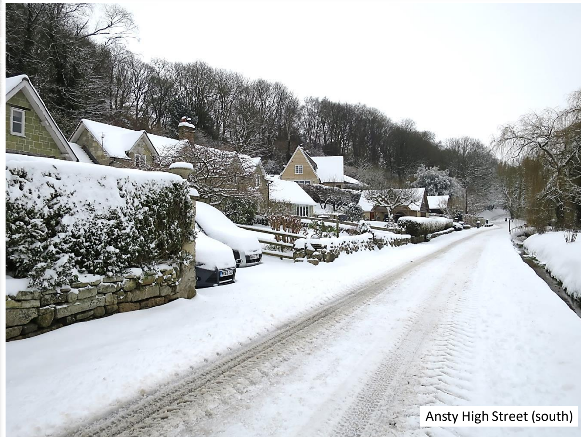
Ansty High Street (south)