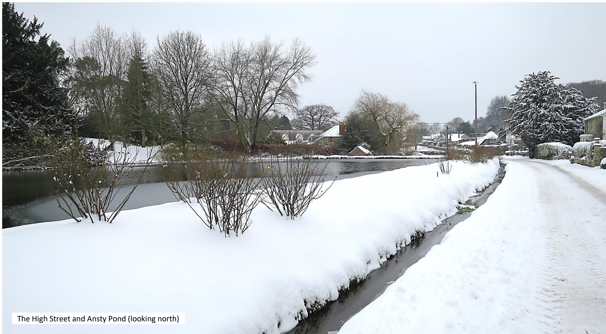
The High Street and Ansty Pond (looking north)