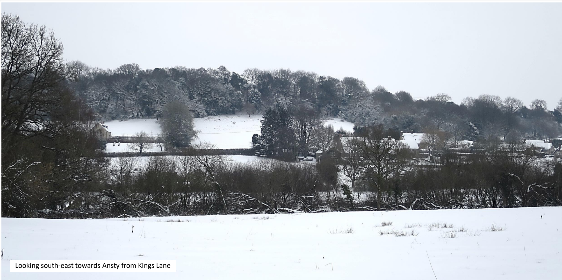
Looking south-east towards Ansty from Kings Lane