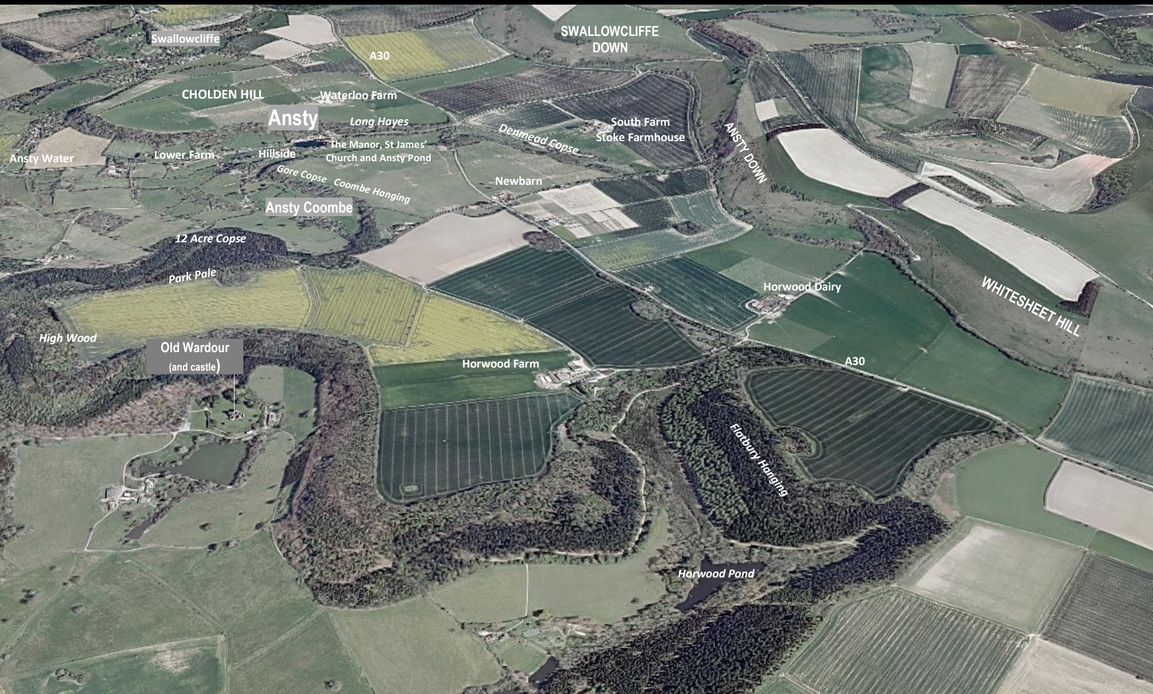
View looking east across the parish of Ansty Village